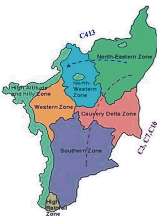
Fig. 2: Zone wise representation of number of clones infested with gall wasp