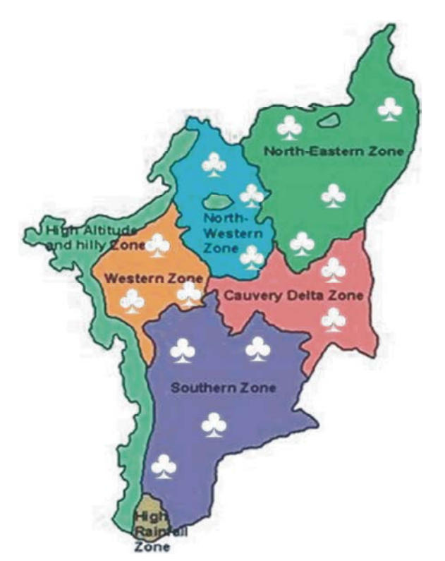
Fig. 1: Study sites in different Agroclimatic zones of Tamilnadu